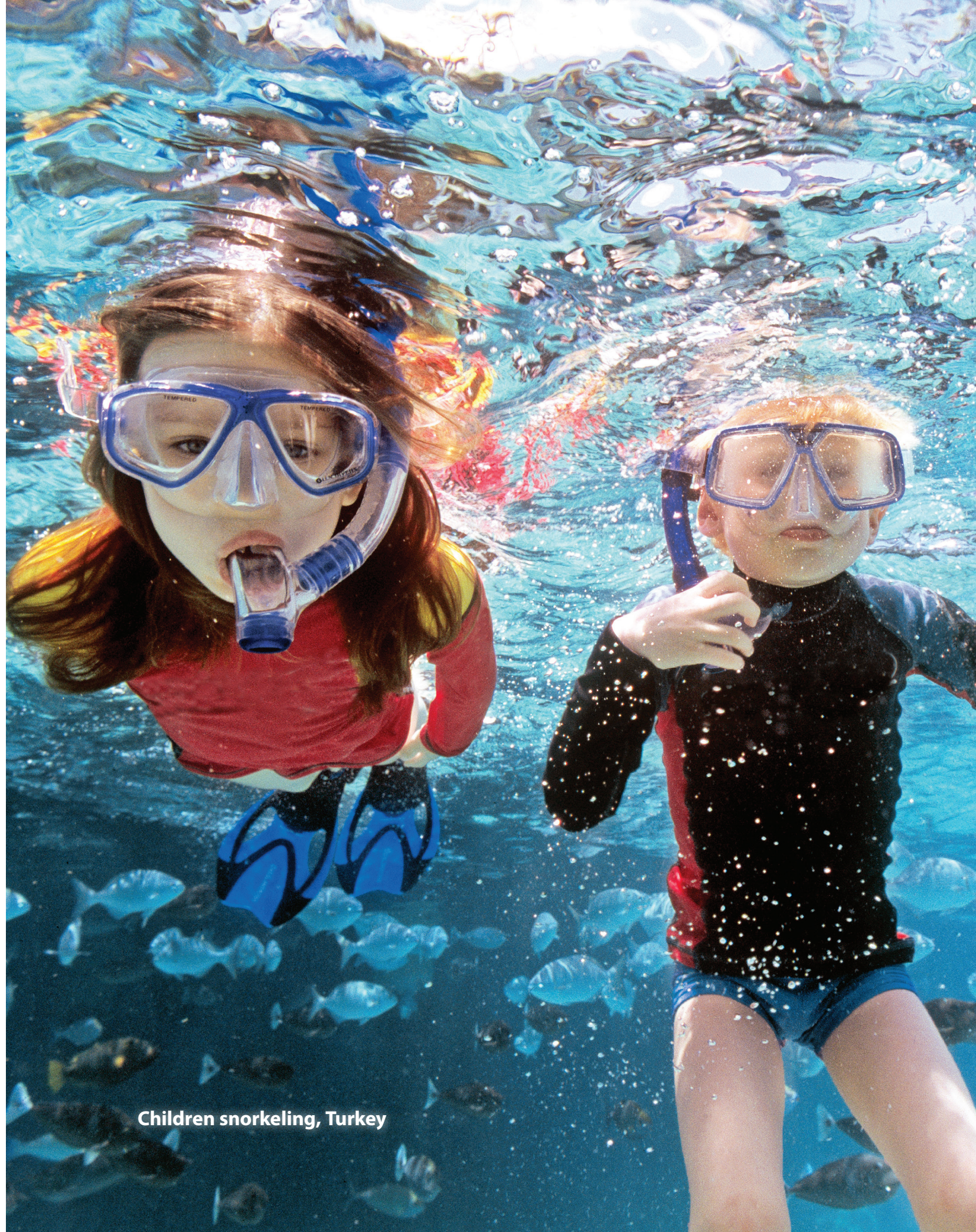
Children snorkeling, Turkey