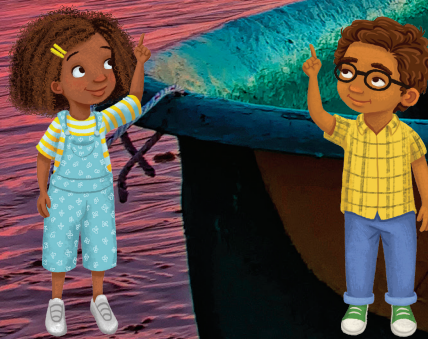
A beach in Thailand