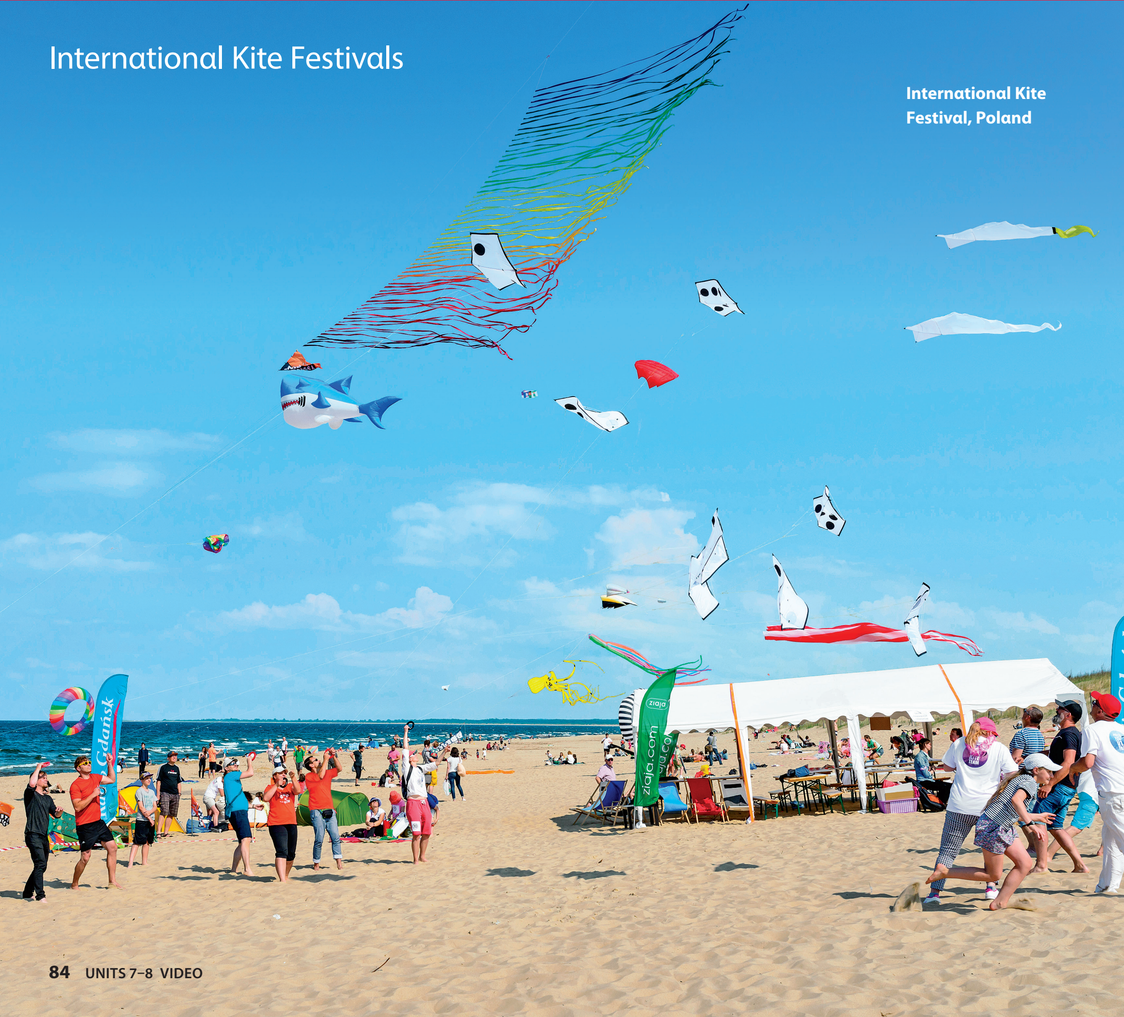
International Kite Festival, Poland

A BEFORE YOU WATCH Look at the photo. What can you see?