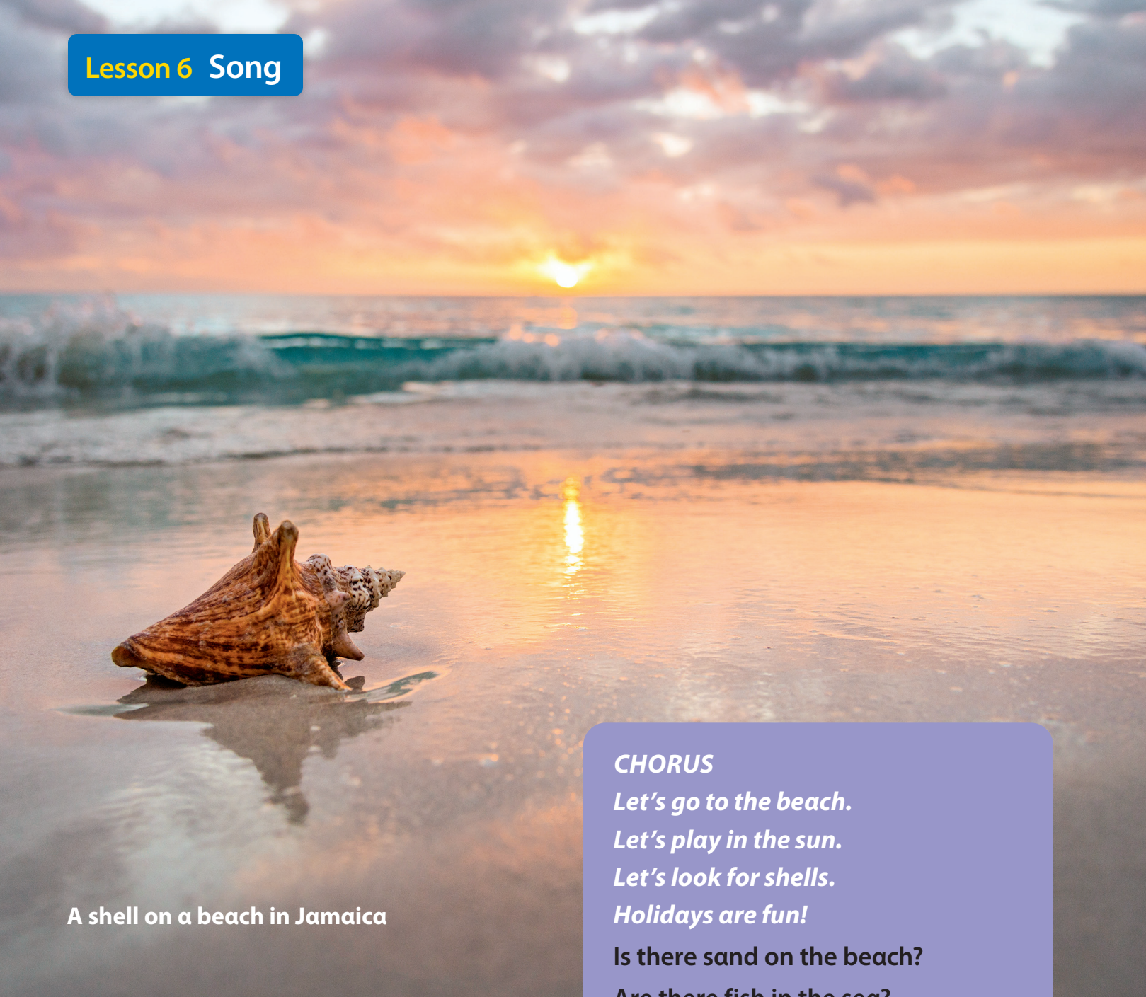
A shell on a beach in Jamaica