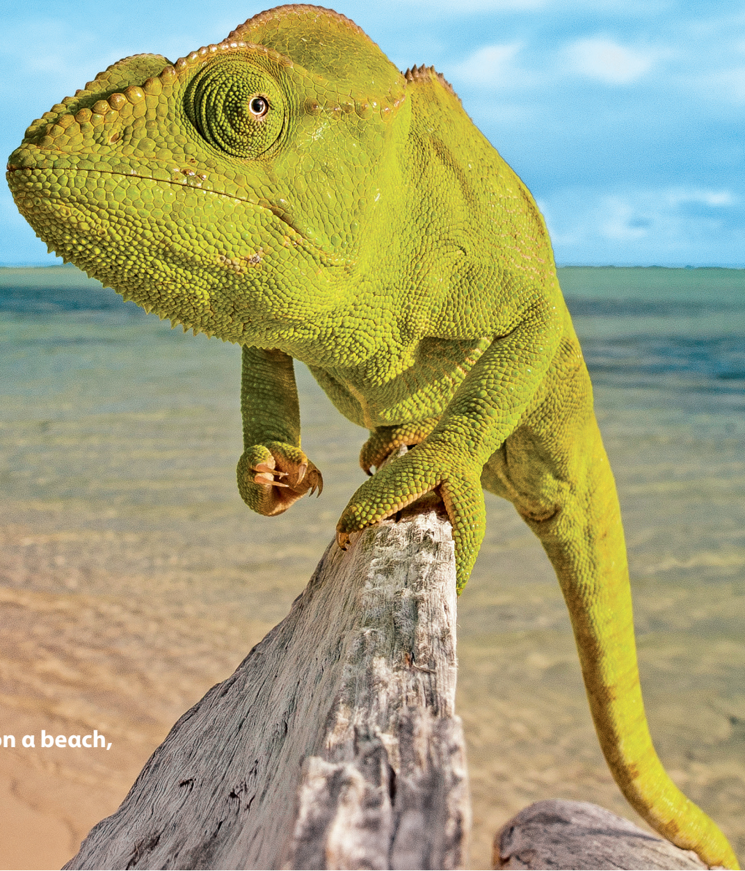
A chameleon on a beach, Madagascar